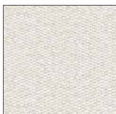
SILVER LINING D263