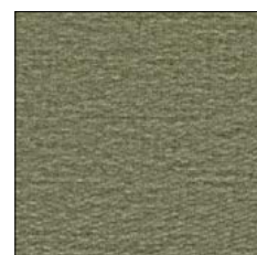
BURNT OLIVE D266