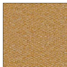
GOLDEN ORANGE D265